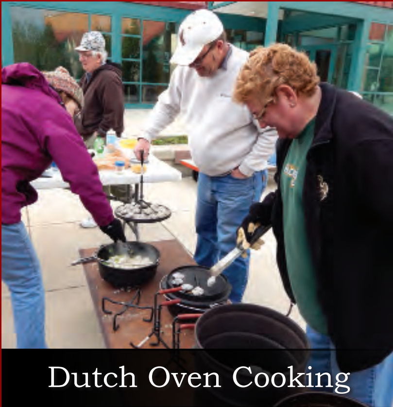
Dutch Oven Cooking