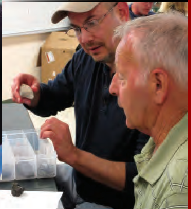
Fossils in Wyoming

PERSONAL AND COMMUNITY ENRICHMENT CLASSES